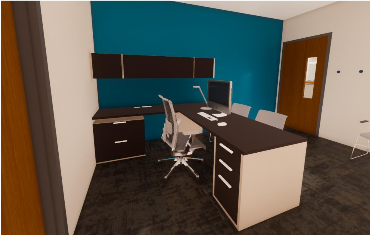
IMAGE IS REPRESENTATIONAL OF SERIES. NOTE: FINISHES IN RENDERING DIFFER FROM SPECS INCLUDE TACKBOARD BELOW OVERHEADS PEDESTALS TO INCLUDE COUNTERWEIGHTS FOR STABILITY PROVIDE ALLOWANCE FOR 3 ACCESSORIES PER WORKSTATION

VENDOR TO PROVIDE THREE-DIMENSIONAL IMAGES OF OFFICE CONFIGURATIONS