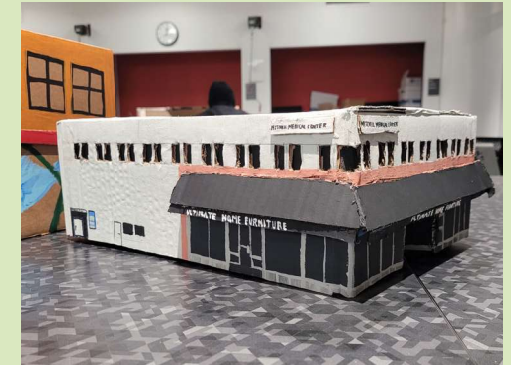
Image left, credit to Anna Kogen http://artprojectsforkids.org/draw-your-neighborhood/