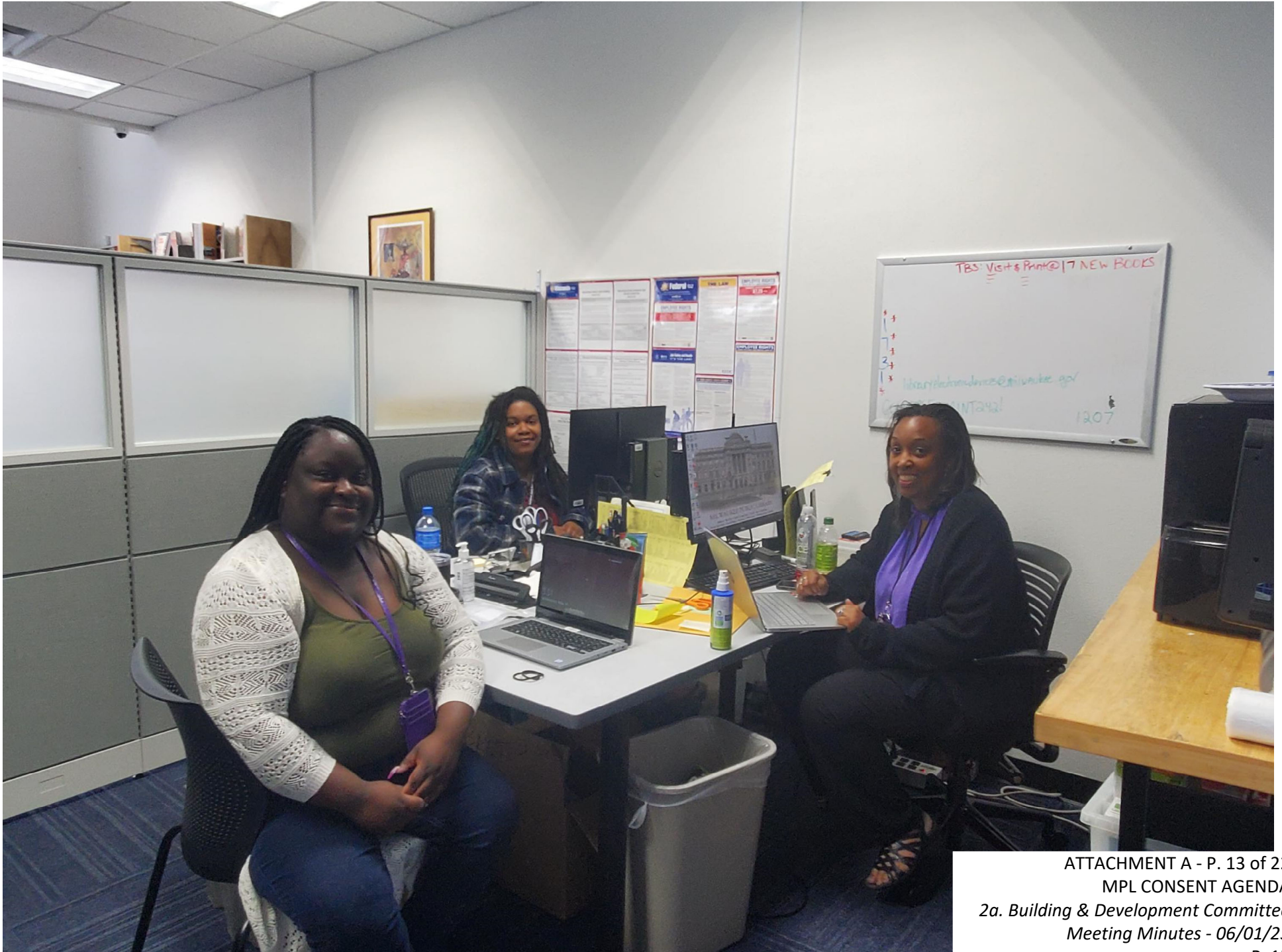
ATTACHMENT A - P. 13 of 22 MPL CONSENT AGENDA 2a. Building & Development Committee Meeting Minutes - 06/01/23 P. 15